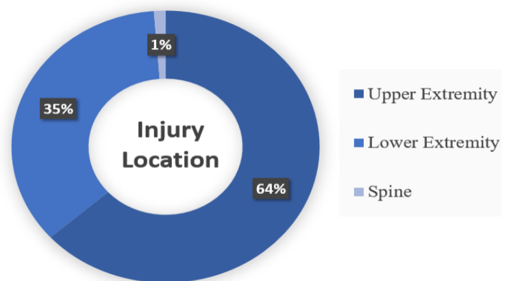
Figure 1. Distribution of e-scooter related injuries by anatomic location

followed by ankle fracture, distal radius fracture, tibial plateau fracture, and finger fracture/dislocation (Table 3). 11% were additionally treated for concomitant nonorthopaedic injuries.